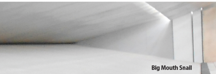
Big Mouth Snail